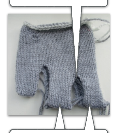
Sew the leg cast off edges together

Sew the cast off stitch on each side together