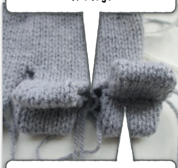
Fold the seamed edge up inside so it is in line with the cast off stitch

This fold creates the four legs. Sew the side edges of each leg together, so you have four little pockets for the legs.