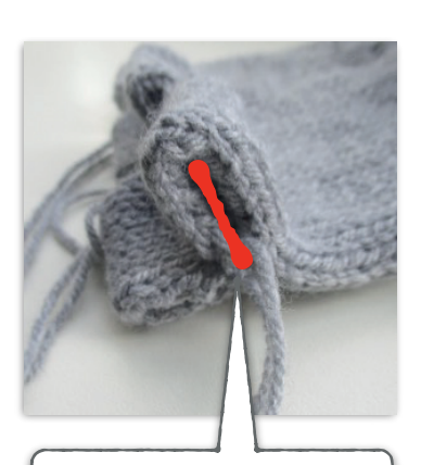
Sew the side edges of each leg together (shown by the red line above)

This fold creates the four legs. Sew the side edges of each leg together, so you have four little pockets for the legs.